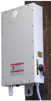
ENGO-V10 Pole Mount